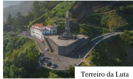
Terreiro da Luta

In the highlands of Funchal, the "Terreiro da Luta" and the serene statue of Our Lady of Peace stand as powerful symbols of this peace, offering hope to everyone who struggles, whether in war or in their own lives.