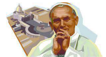
- St. John Paul II

"None of us is alone in this world. Each of us is a vital piece of the great mosaic of humanity as a whole."